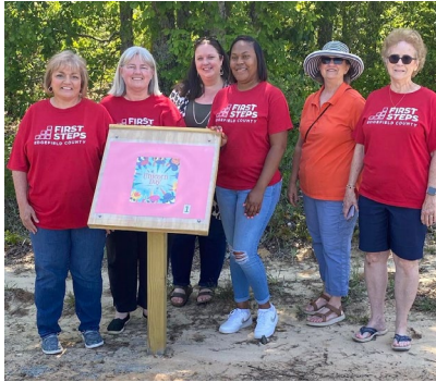
Board members attending the StoryWalk ribbon cutting ceremony.